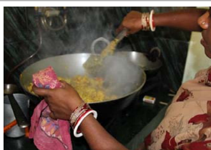
In India, where electricity is spotty, girls rescued from slavery cook over a stove, thanks to ‘Dress for a Good Cause’ and Gundaker Foundation grant.